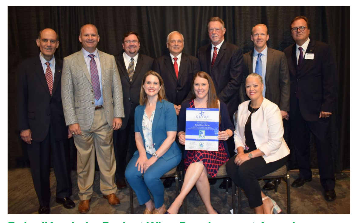
Bois d'Arc Lake Project Wins Development Award The Bois d'Arc Lake Project received the Celebrating Leadership in Development Excellence (CLIDE) Award for Special Development this June for its exemplary environmental stewardship. Every other year, the Center of