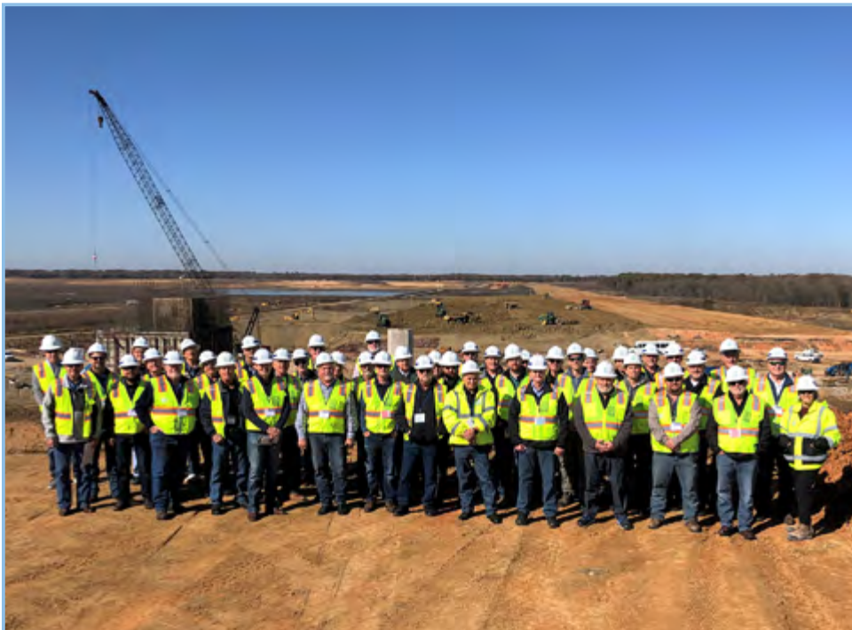
NTMWD Member City Leaders visit the site of the future Bois d'Arc Lake.