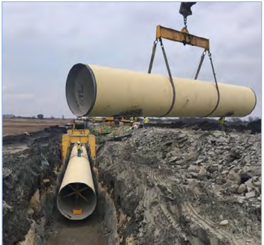
Laying a 50 ft. long, 25,000 lb. piece of raw water pipe that will eventually deliver water from Bois d'Arc Lake for treatment.

The pipeline is scheduled for completion in the summer of 2021.