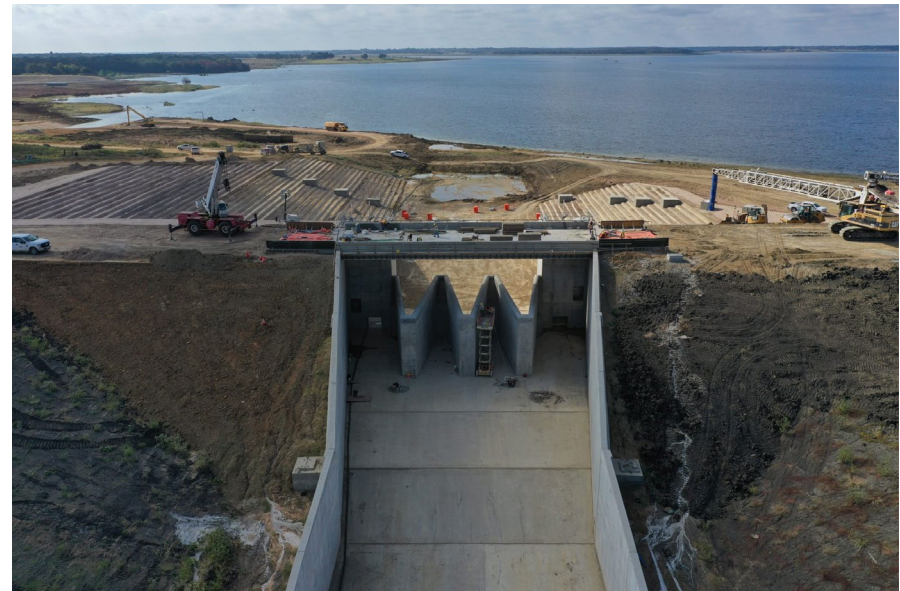
Bois d'Arc Lake – October 2021